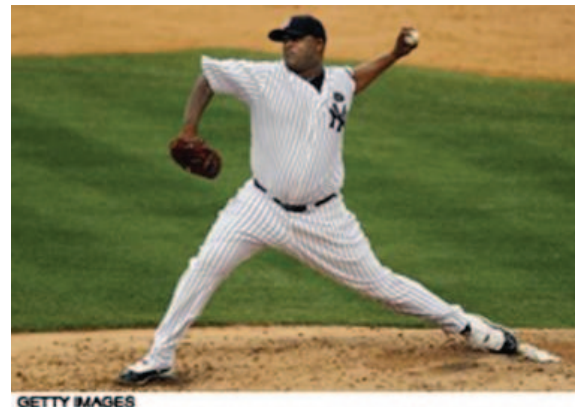
Sportvision's Pitch f/x system identified a problem in CC Sabathia's throwing motion.

For example, it can now be easily determined what the arm angle and release point was for a pitcher on every pitch that resulted in an extra base hit against a given opponent in a chosen game situation. Or the release angle on every successful three-point shot for a particular basketball player from a certain spot on the floor. Or the exact velocity and trajectory for one soccer player's successful corner kicks against a chosen opponent. And on and on the possibilities go, with teams using the technology both to refine their own players' performances as well as scout opponents for weaknesses.